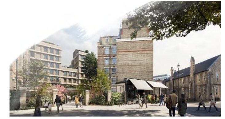
Figure 1 – Cundy St Quarter Architectural Render

Lodha is delivering Phase 1 of the Cundy Street Quarter project which includes Building A (residential on the corner of Ebury & Cundy st) and Building C (affordable housing on Ebury st). Keltbray have been appointed by Lodha as the contractor for the piling works for Phase 1.